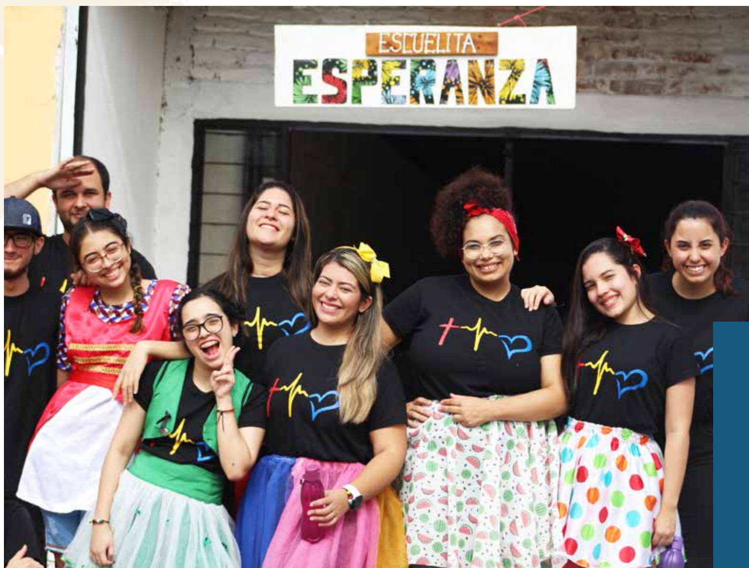
A school celebrations in Uruguay.