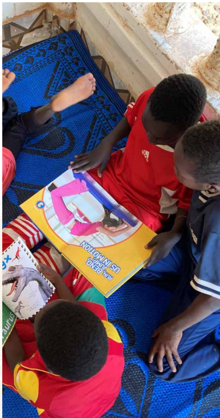
A group of students read together in the library.