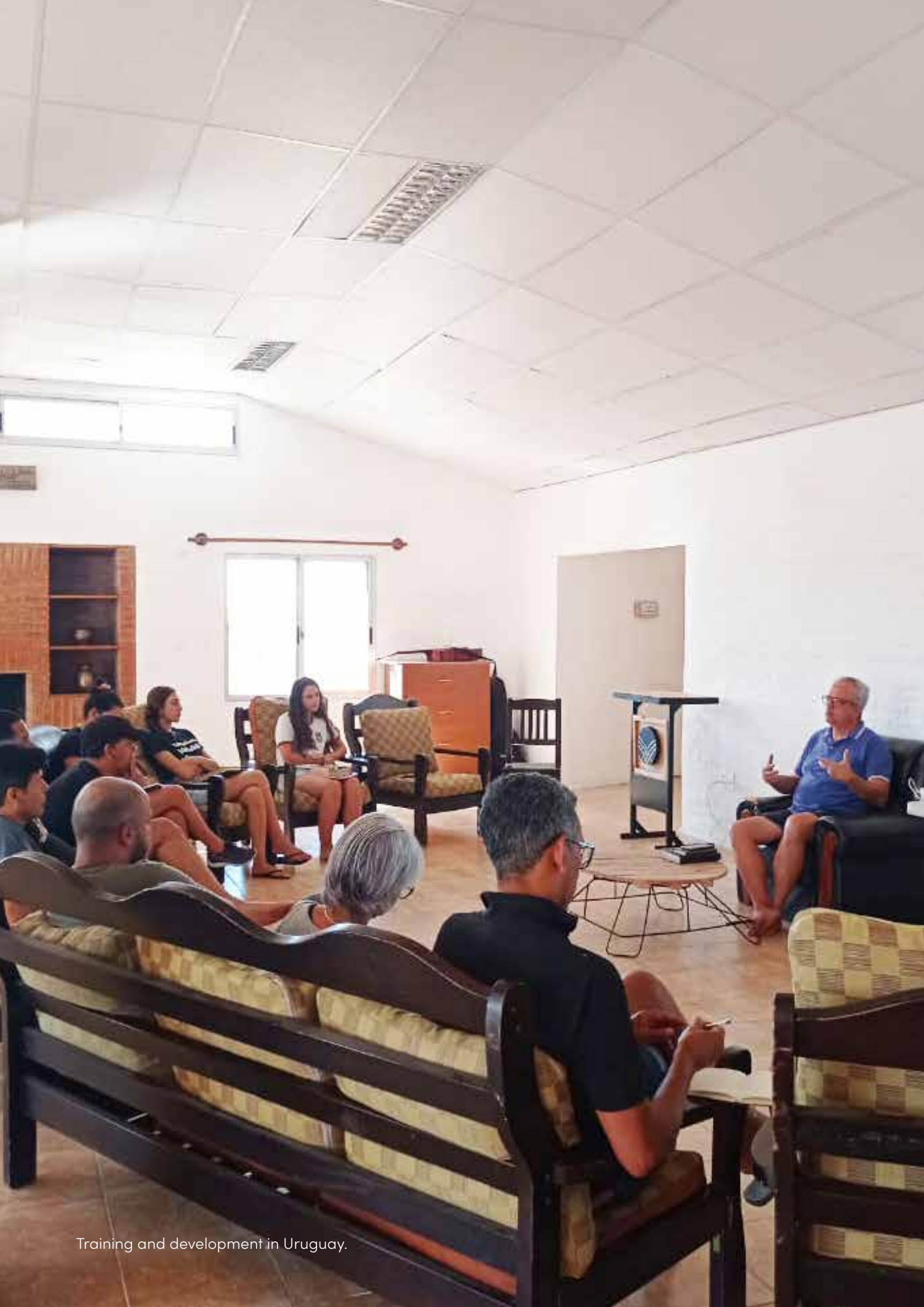
Training and development in Uruguay.