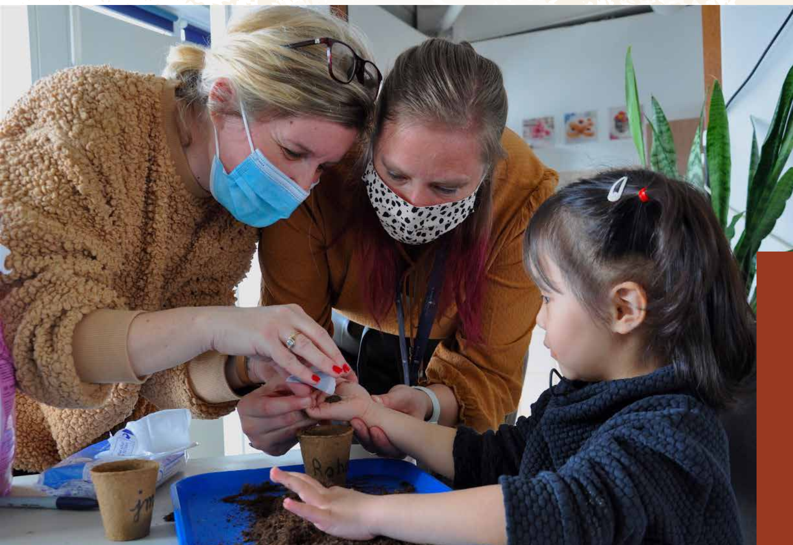
Interactive projects, starting with the littlest of learners!