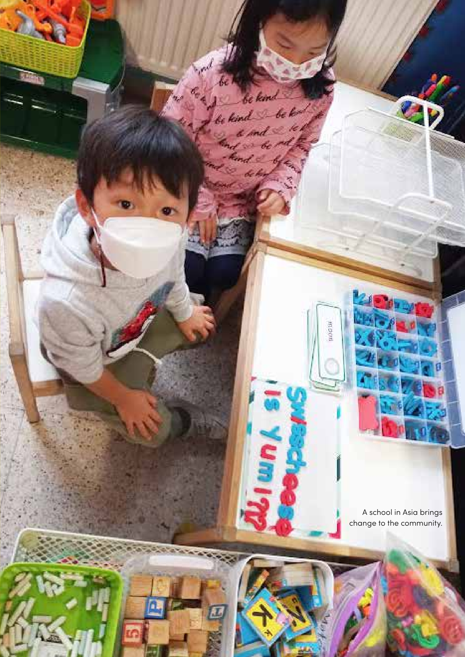
A school in Asia brings change to the community.